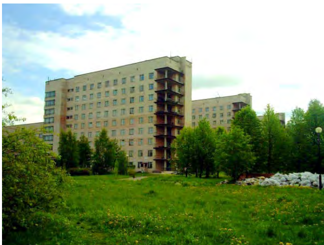
One of the four major wings of St. Elizabeth Hospital

We do arrive to the entrance for the Out-Patient clinic where the Chiropractic Clinic is located. Fortunately, it is nice distance away from the morgue!