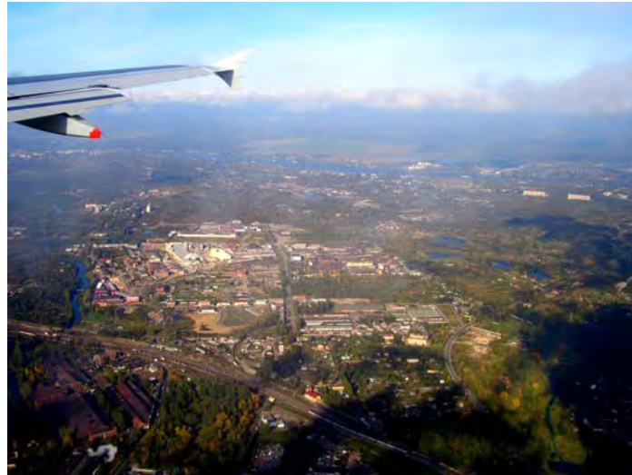
Aerial view right over St. Petersburg area

Upon arriving, the weather was beautiful. Sadly, this was short lived and we experienced only fleeting moments of this throughout my stay this time. For the most part, this time of the year is when things begin to move towards wet and cold.